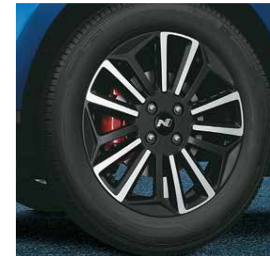
R16 (D=405.6mm) diamond cut alloy wheels with N logo and front disc brakes with red caliper