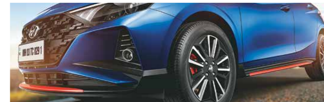
Athletic red highlights* (front skid plate & side sill garnish)

Sporty and breathtakingly stunning, the Hyundai i20 N Line commands attention everywhere it goes with its WRC inspired sporty new design. Its exciting new athletic design and playful details set you apart from the crowd in a field of lookalikes.