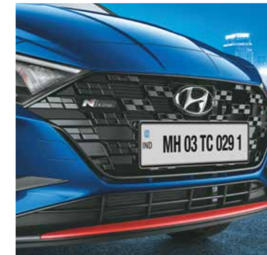
Chequered flag inspired front grille

Images are for creative purposes only. Please do not imitate. Hyundai encourages safe driving practices.