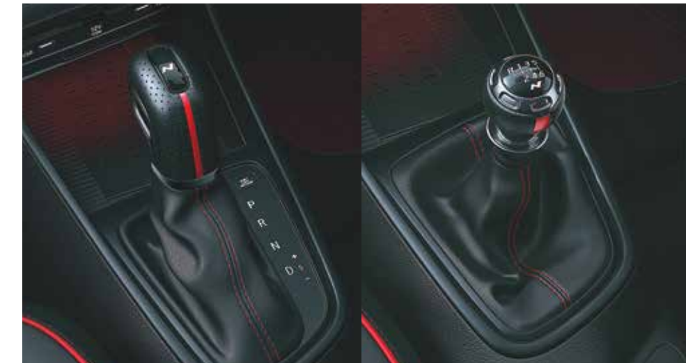
Perforated leather* wrapped gear knob with N logo (7 DCT & iMT)