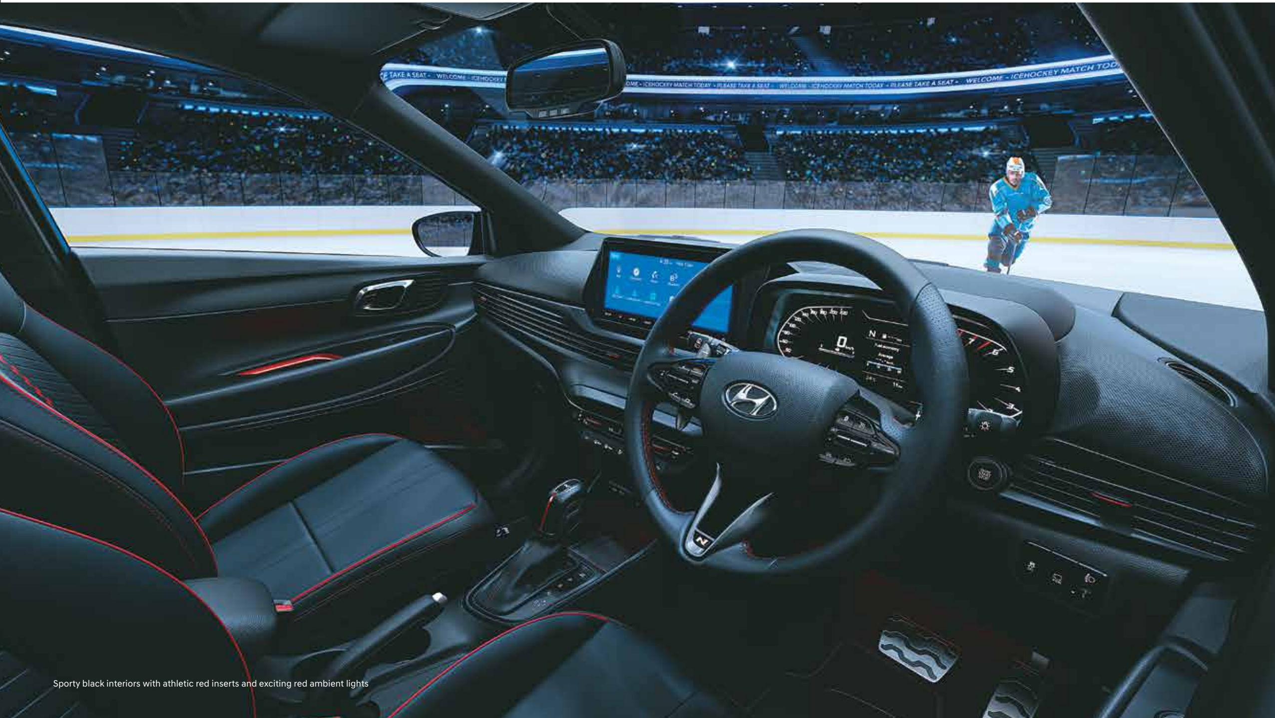
Sporty black interiors with athletic red inserts and exciting red ambient lights