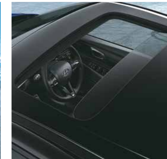
Voice enabled smart electric sunroof