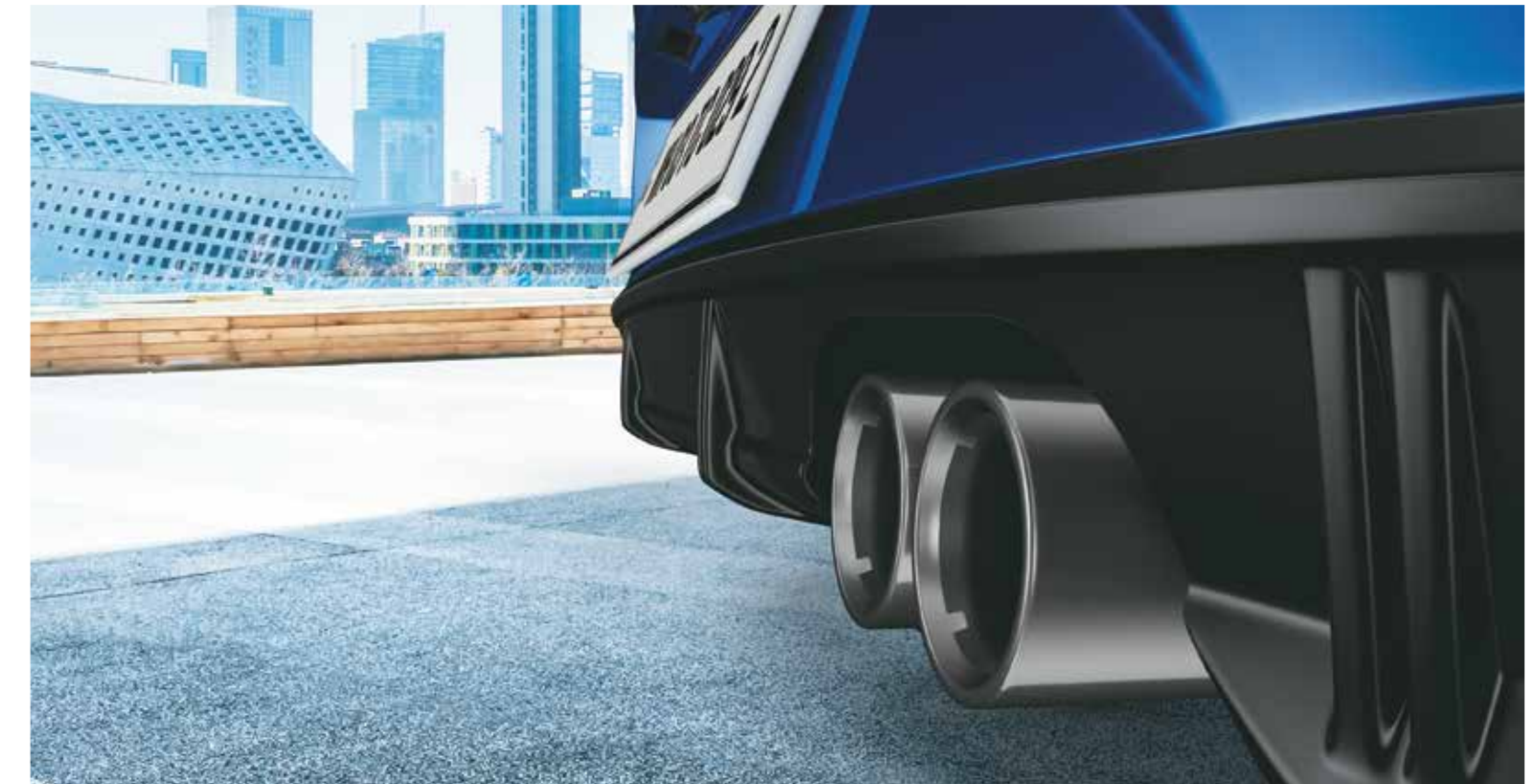
Twin tip muffler