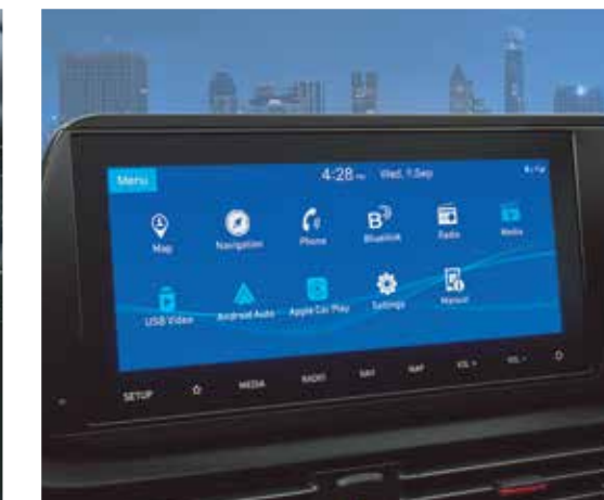
26.03 cm (10.25") HD touchscreen infotainment & navigation system