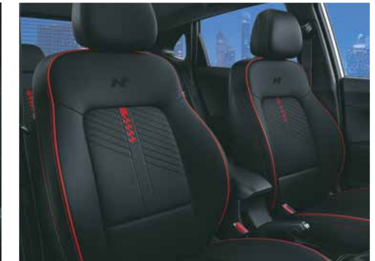
Chequered flag design leather* seats with N logo