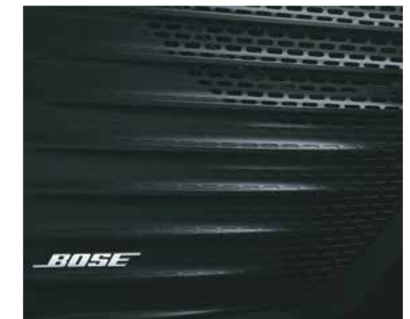
Bose premium 7 speaker system

Other features – Wireless charger with cooling pad | Digital cluster with TFT multi information display (MID) | Rear seat armrest