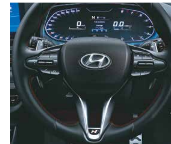
3-spoke steering wheel with N logo

With Over-the-Air (OTA) map updates* 3 years free Bluelink subscription