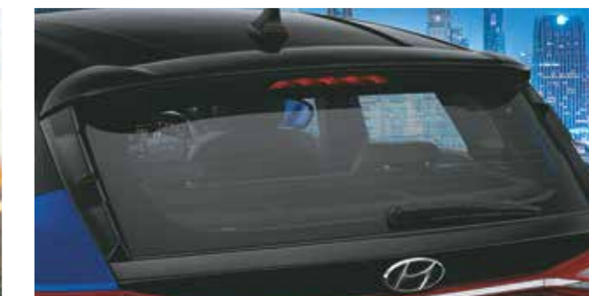
Sporty tailgate spoiler with side wings

Other features – LED projector headlamps with LED day time running lamps (DRL) | Dark chrome connecting tail lamp garnish Front fog lamp chrome garnish