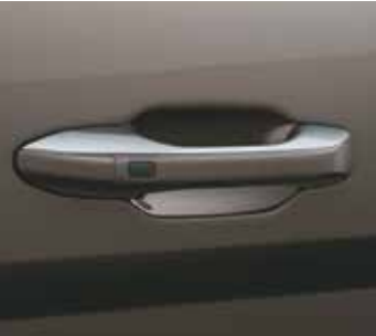
Dark chrome exterior finish outside door handles

Other features: LED positioning lamps | Crescent glow LED DRLs | Trio beam LED headlamps Dark chrome exterior signature cascading grille | LED fog lamps