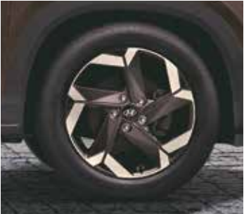
R18 (D=462 mm) Diamond cut alloys