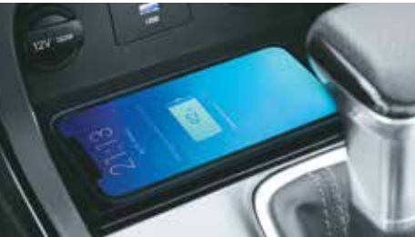
1 st & 2 nd row smartphone wireless charger