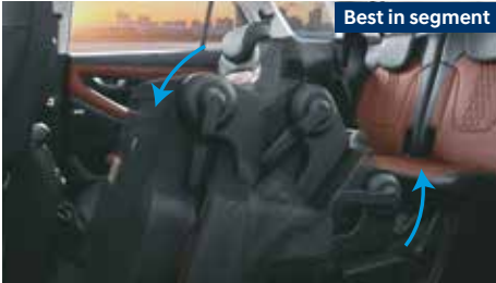
2 nd row - one touch tip tumble captain & split seats