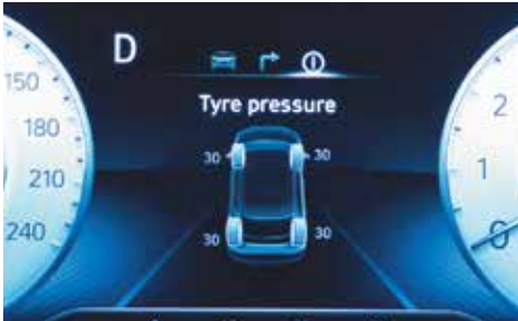
Tyre pressure monitoring system (Highline)