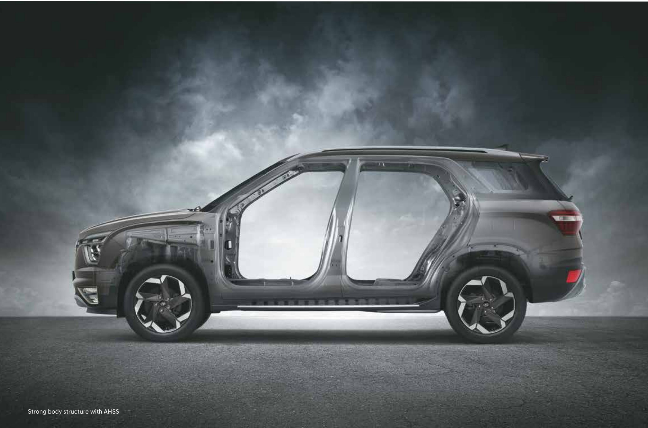
Strong body structure with AHSS