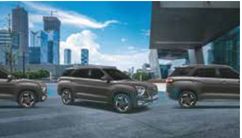
Parking assist: Front and rear parking sensors

Other features: Emergency stop signal | Speed alert system | Speed sensing auto door lock | Driver rear view monitor Impact sensing auto door unlock | Child seat anchor (ISOFIX) | Electric parking brake with auto hold