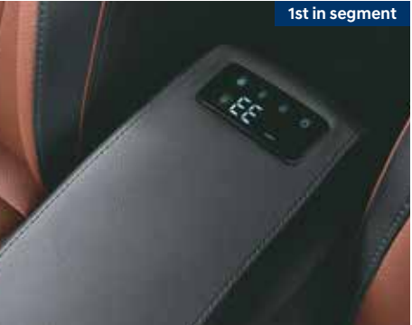
1st in segment