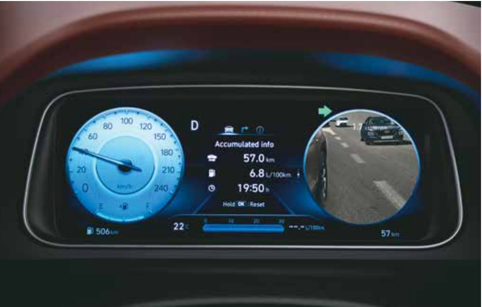
Blind view monitor (BVM)

Each element of the Hyundai ALCAZAR has been designed to provide excellence, in comfort and in safety. Complete with highly accurate front & rear parking sensors and state-of-the-art security alerts like speed alert system, you're always one step ahead of unexpected events on the road. Each journey in the Hyundai ALCAZAR inspires awe and admiration as it carries passengers in uncompromised safety.