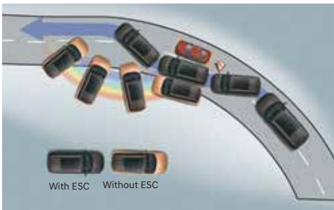
Electronic stability control (ESC)