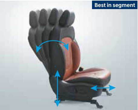
Best in segment