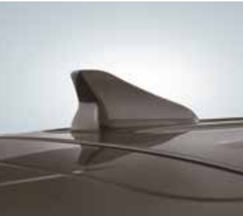
Shark fin antenna