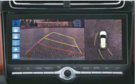
Surround view monitor (SVM)