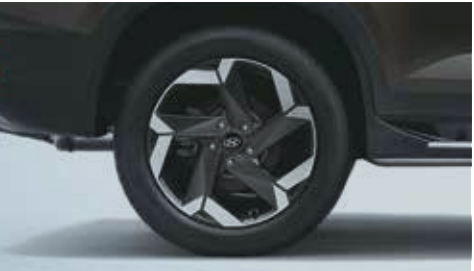
Rear disc brakes