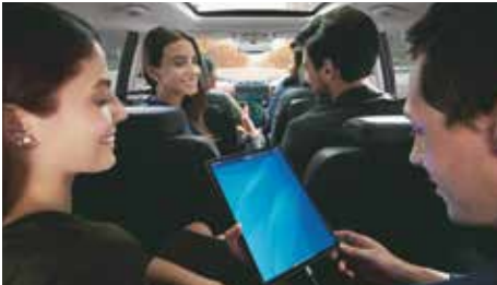
4 USB chargers for 3 rows