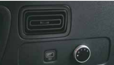
3 rd row AC vents with speed control (3-stage)