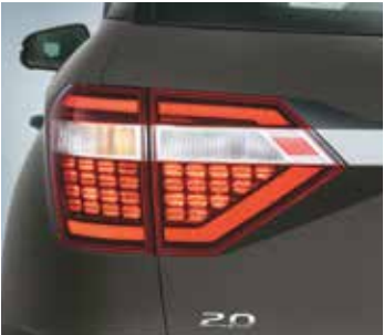
Honey-comb inspired LED tail lamps