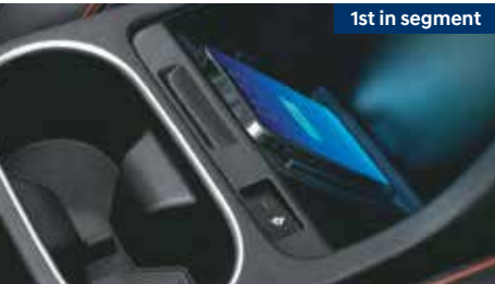
1 st in segment