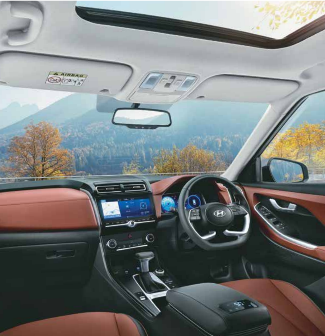
Premium dual tone cognac brown interiors