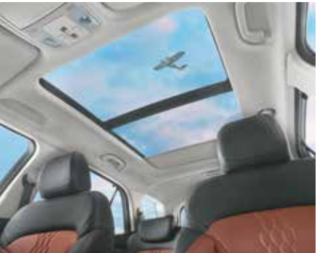
Voice enabled smart panoramic sunroof