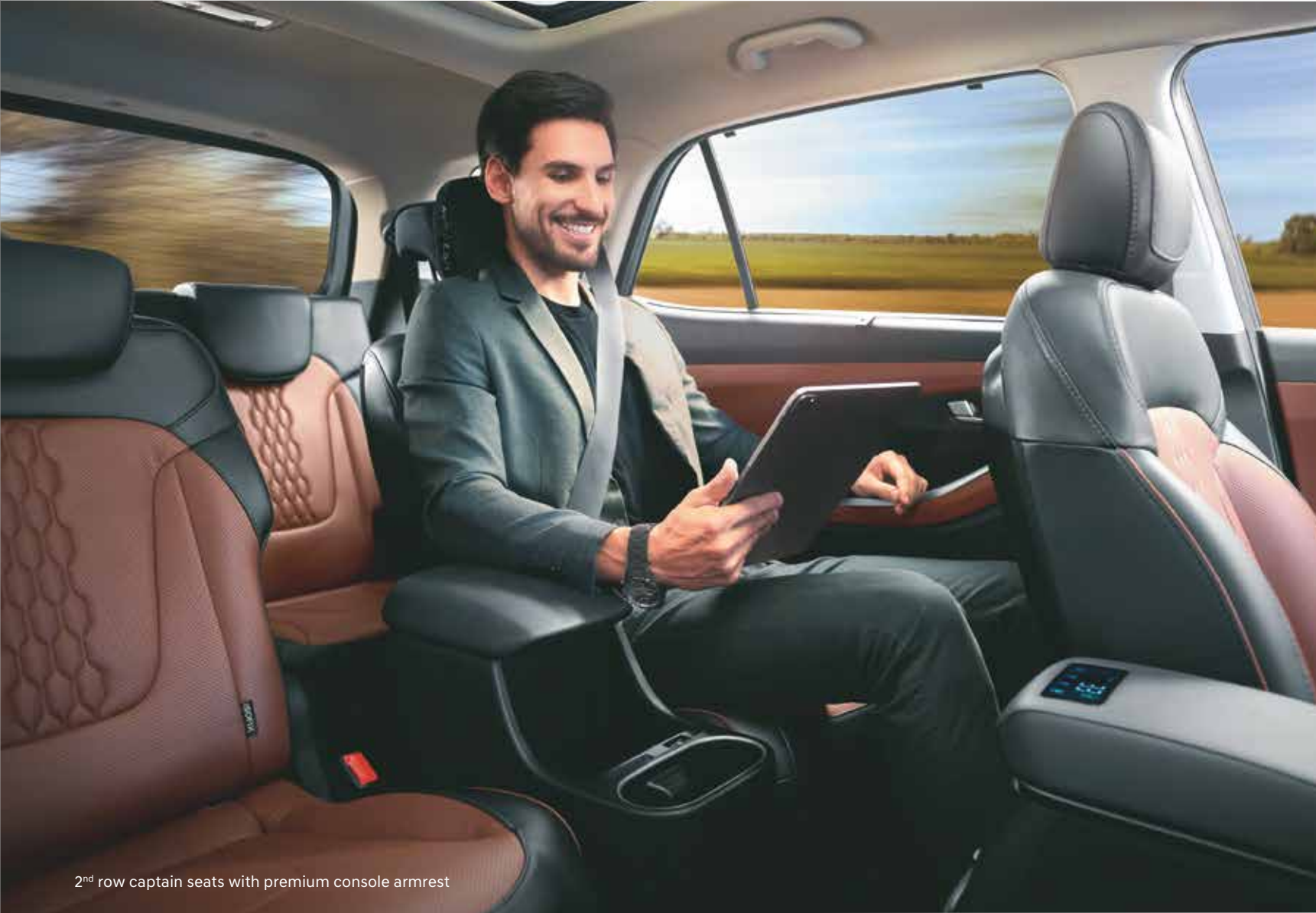
2 nd row captain seats with premium console armrest