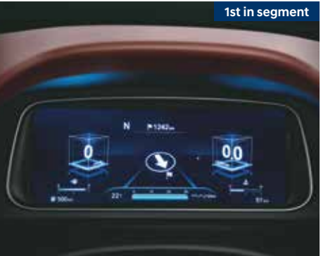
1st in segment