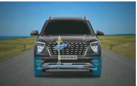
Vehicle stability management (VSM)