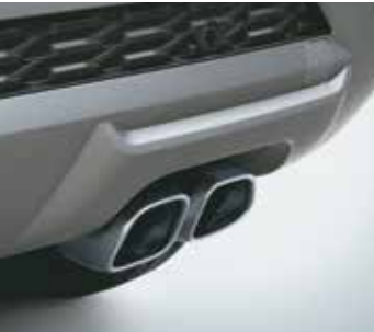
Twin tip exhaust