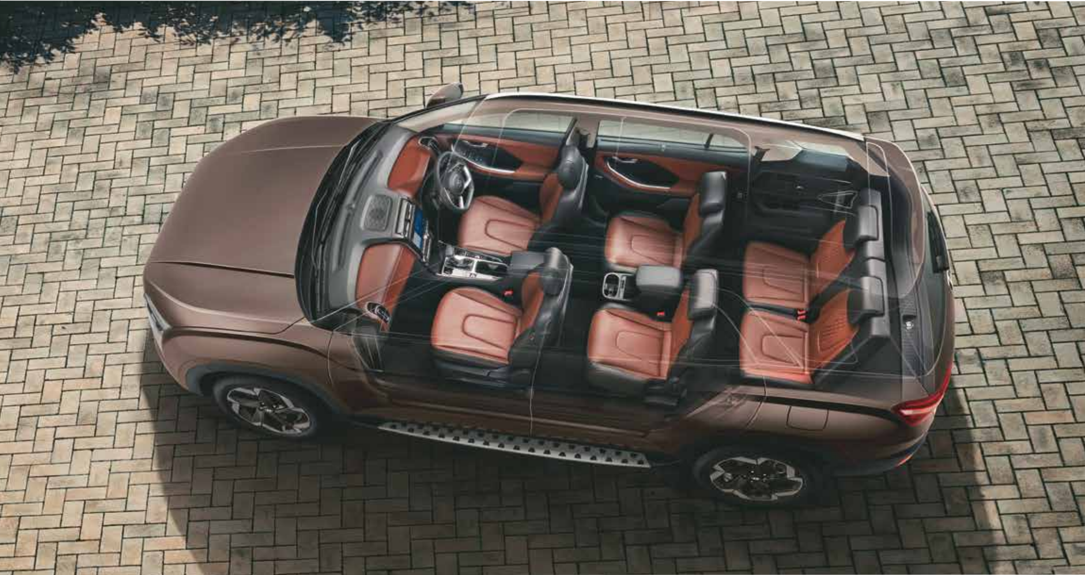
Leather pack: Perforated D-cut steering wheel | Perforated gear knob | Cognac brown and black seat upholstery | Door armrest

The interior of the Hyundai ALCAZAR immerses you in uncluttered design. Complete with premium dual tone cognac brown interiors, the 64 colours ambient lighting offers a regal touch to the cabin. Carefully selected materials accentuate the aesthetic, complete with Hyundai ALCAZAR's advanced technology, ensuring that your entertainment knows no bounds. Experience serenity thanks to a voice controlled panoramic sunroof and an auto healthy air purifier. The tranquil sanctuary is also outfitted with an HD touchscreen system with powerful Bose premium sound system, immersing you in a rich and balanced premium audio experience.