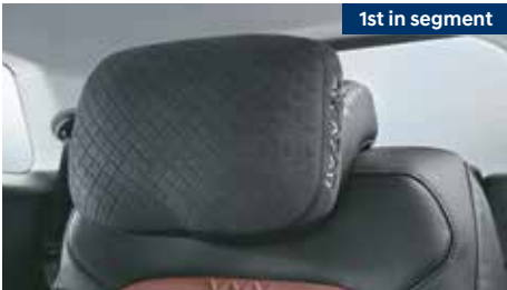
2 nd row headrest cushion