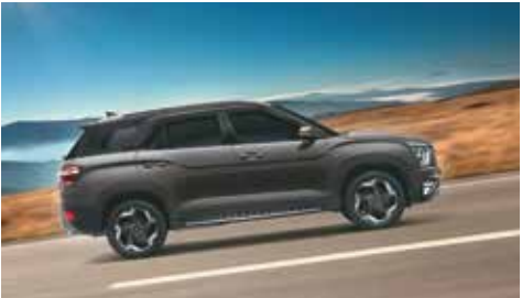
Hill start assist control (HAC)