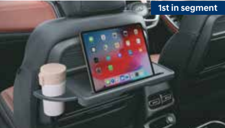
Front row seatback table with retractable cup-holder and IT device holder