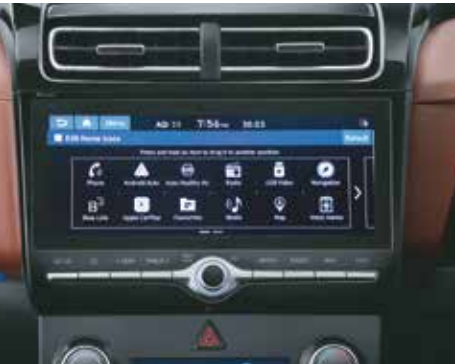
26.03 cm (10.25") HD touchscreen system