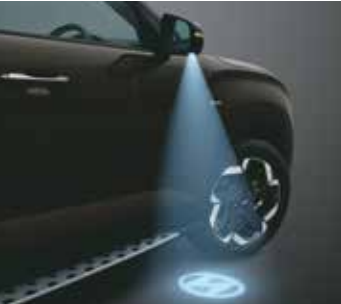
Puddle lamps with Hyundai logo projection