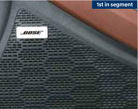
1st in segment