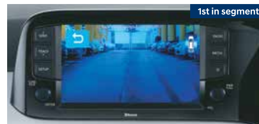
Driver rear view monitor