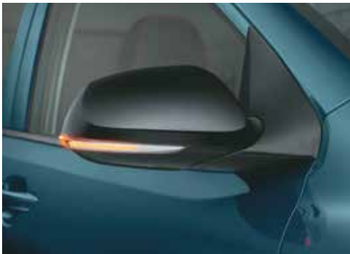
Electric folding outside mirror with turn indicator