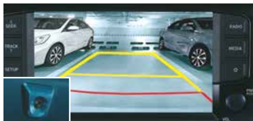
Rear parking camera with display on 20.25 cm (8'') screen