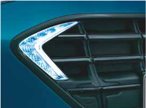
Boomerang shaped LED DRLs