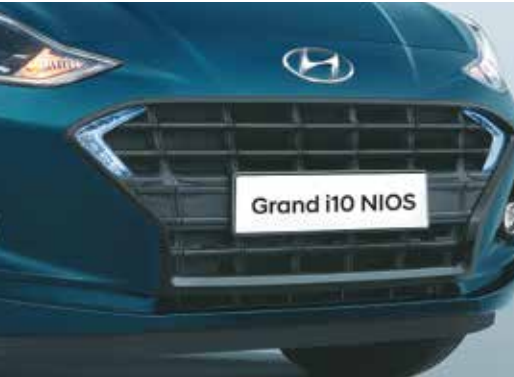
Glossy black radiator grille*

Admire it from any angle, and Grand i10 Nios will catch your eye with its bold stance and contemporary design. Check out its new projector headlamps & foglamps for enhanced visibility. Body coloured bumpers, chrome door handles and blacked out B-pillar & window line give it a differentiated road presence.