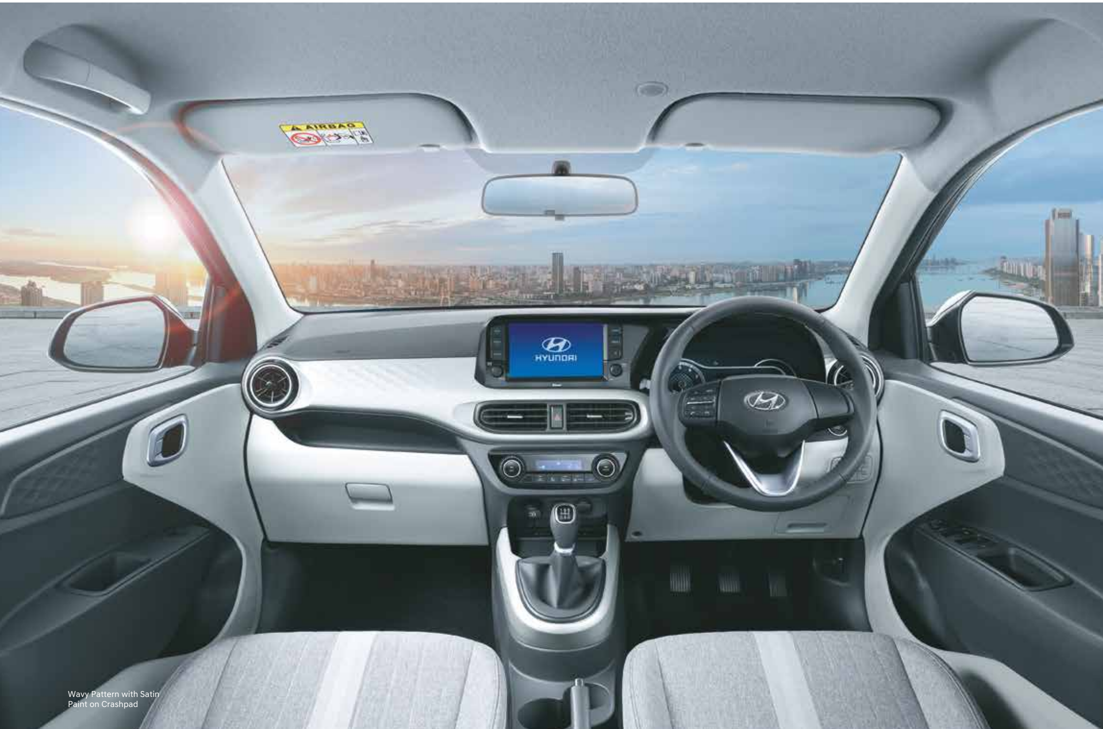
Wavy Pattern with Satin Paint on Crashpad