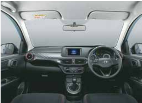
All black interiors with red colour inserts