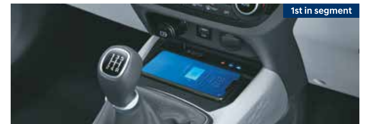
Wireless phone charger

Other features: Cooled glove box | Driver's footrest | Tilt adjustable steering | Fully automatic temperature control | Adjustable rear seat headrest | Passenger vanity mirror