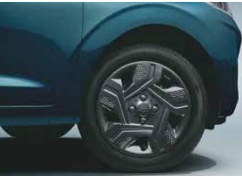
175/60 R15 (D=380.2 mm) Gun metal styled wheel

Step into the world of high-powered executives with the bold Grand i10 Nios corporate edition. A seamless blend of cutting-edge technology and new age style makes it the perfect statement for the young professional. Subtle details accentuate the corporate edition, like all-black interiors with red inserts, elegant chrome garnish and a 17.14cm touchscreen infotainment system, ensuring that you'll have a truly extraordinary driving experience.