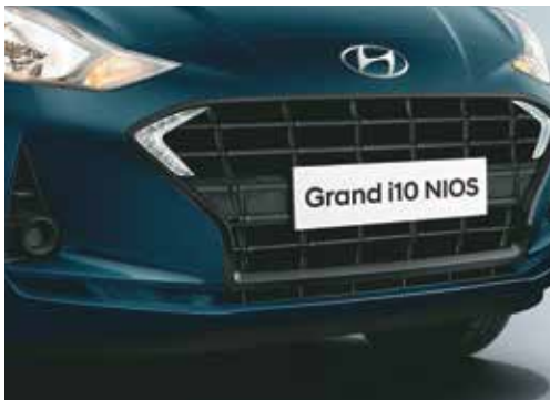
Glossy black radiator grille