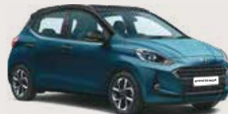
Aqua teal with black roof

Black interiors with aqua teal inserts available in :