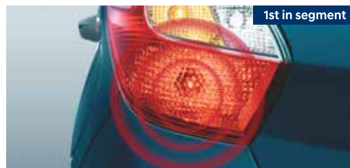
Emergency stop signal