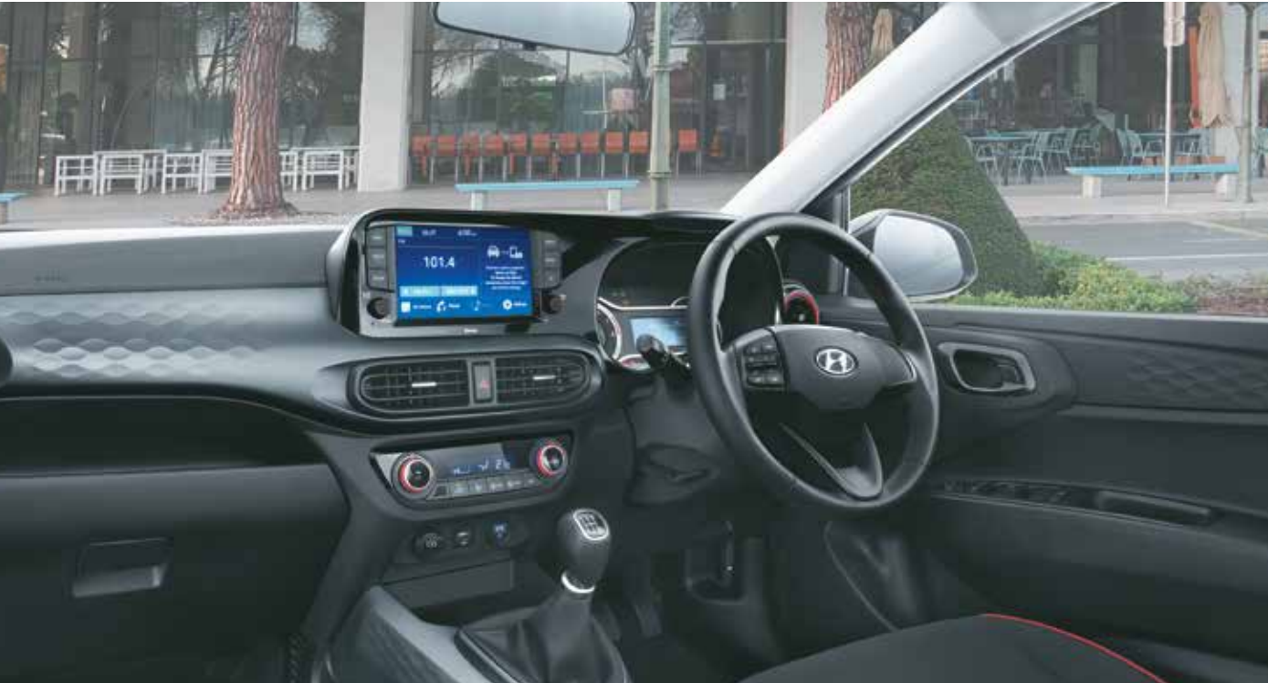
Dual tone interior option

Other features: Steering mounted audio & bluetooth controls | USB charger | iblue smartphone remote application* 20.25 cm (8") Touchscreen infotainment system with smartphone connectivity Best in segment