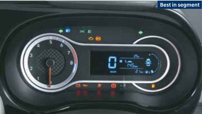
13.46 cm (5.3") digital speedometer