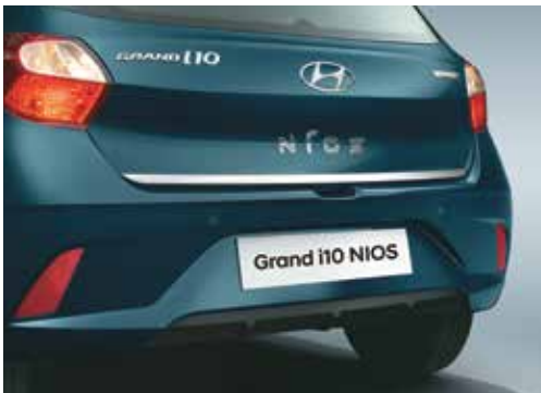
Rear chrome garnish