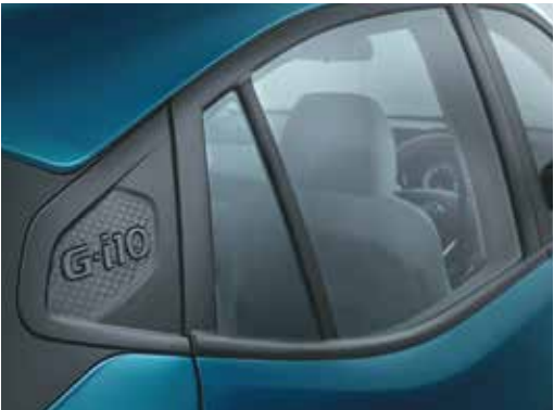
Unique G-i10 branding on C pillar