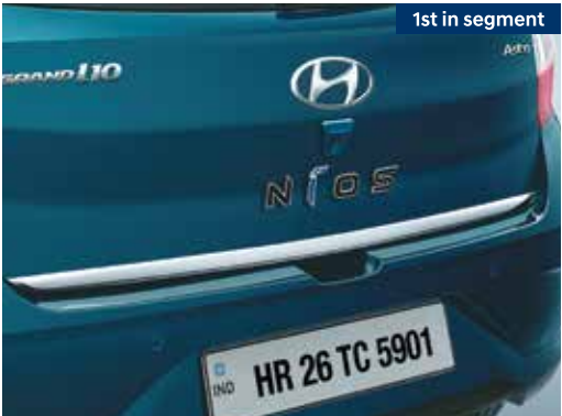
Rear chrome garnish

Other features: Roof rails | Air curtain | Sporty rear skid plate | Turn indicators on outside mirrors | Projector fog lamps | Body coloured bumpers