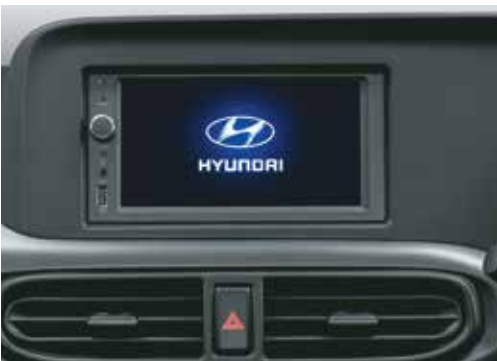
17.14 cm Touchscreen infotainment