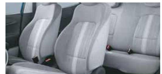
Anti-bacterial anti-fungal seats

Other features: Speed alert system | Front seatbelt pretensioner with load limiters | Rear defogger Impact sensing auto door unlock / Speed sensing auto door lock | Headlamp escort function