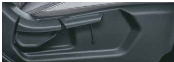
Driver seat height adjuster