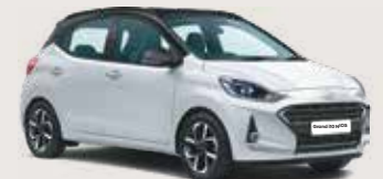
Polar white with black roof

Black interiors with red inserts available in :