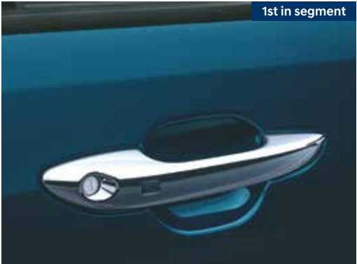
Chrome door handles