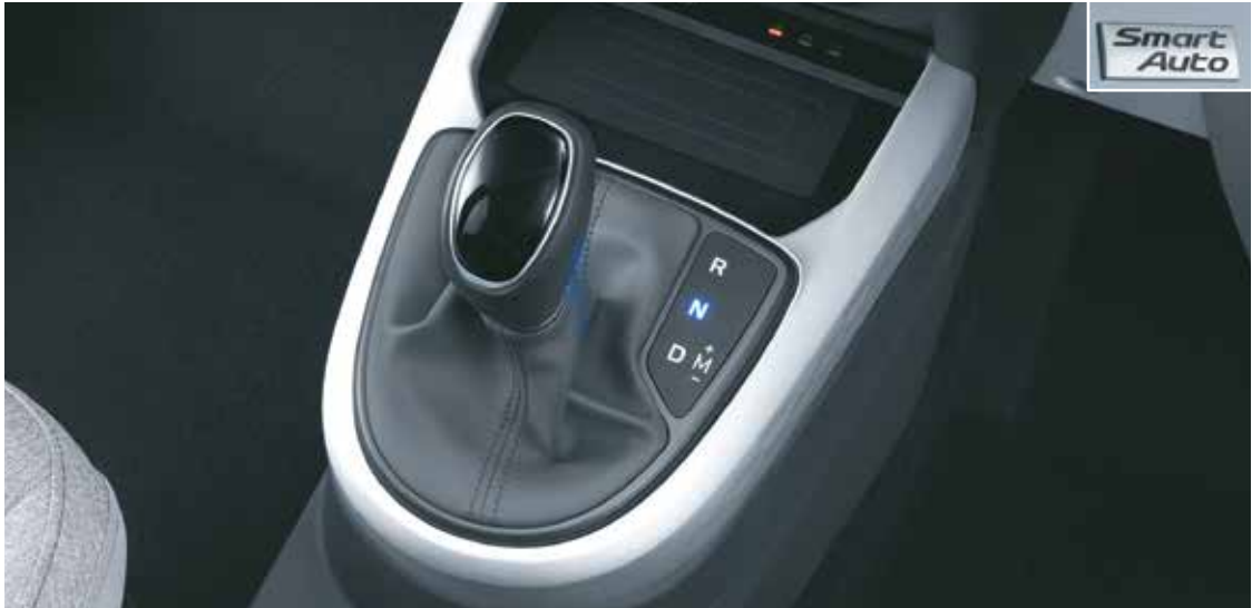
AMT in 1.2 petrol