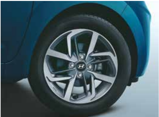
R15 (D=380.2 mm) diamond-cut alloy wheels