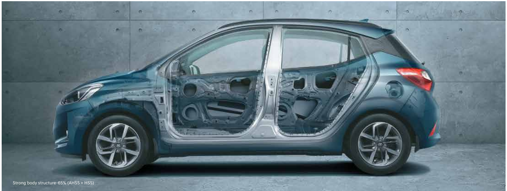
Strong body structure-65% (AHSS + HSS)